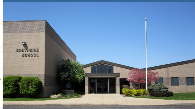
Southside Elementary School