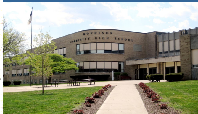
Morrison High School