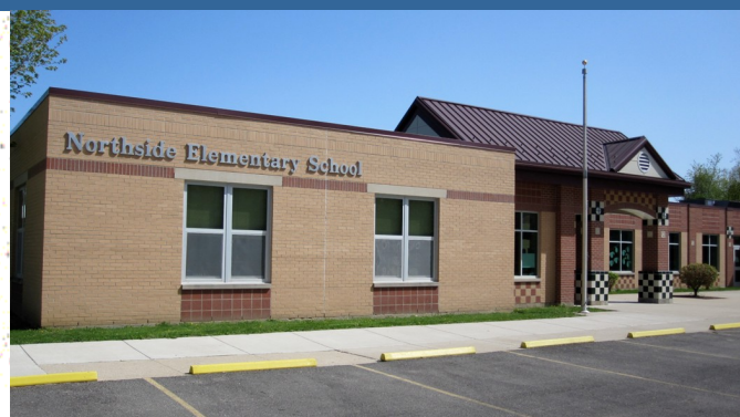
Northside Elementary School

MHS students may earn high school and college credit at the same time. The dual enrollment program provides the opportunity for high school students to jump-start their college education by enrolling in college-level courses, while still attending high school. Juniors and seniors at Morrison High School may participate in career and technical education training, held at the Whiteside Area Career Center in Sterling, IL. Students are transported to the center to participate in work-based programs from auto and computer technology, digital media arts, criminal justice, and health occupations to name a few.