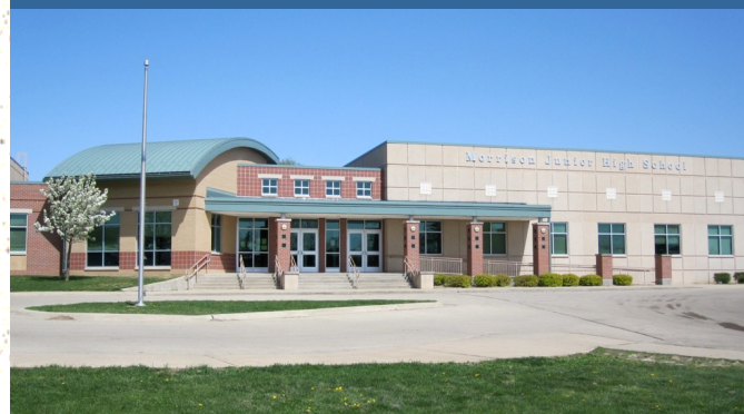
Morrison Junior High School